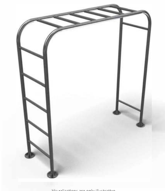
Visualizations are only illustrative Right to make changes is reserved