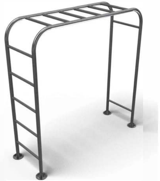
Visualizations are only illustrative Right to make changes is reserved

Remarks: Maximum allowed weight of a user is 120 kg. The area of 2 meters from the user/machine must stay clear during the workout. Without attendance, kids with minimum height 140 cm are not allowed. Other than proper use is prohibited. The device is in compliance with the standard ČSN EN 16630.